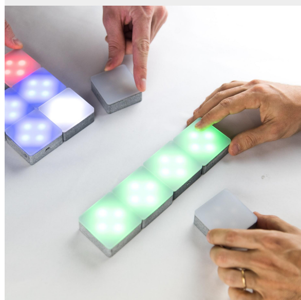
Final UWTI interactive brick